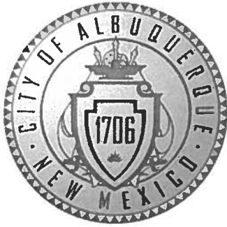
Mayor Timothy M. Keller