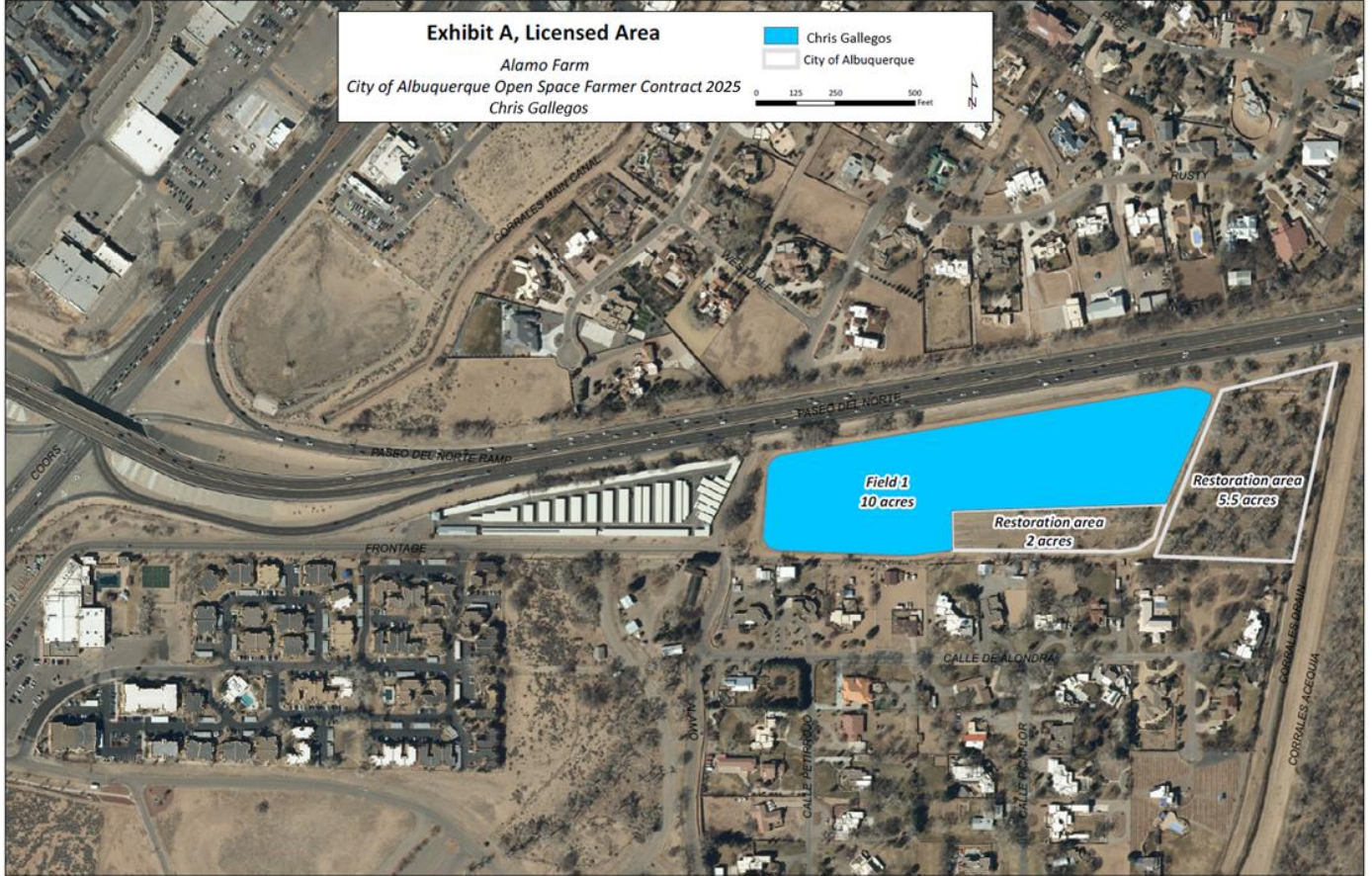
EXHIBIT A LEASED AREA