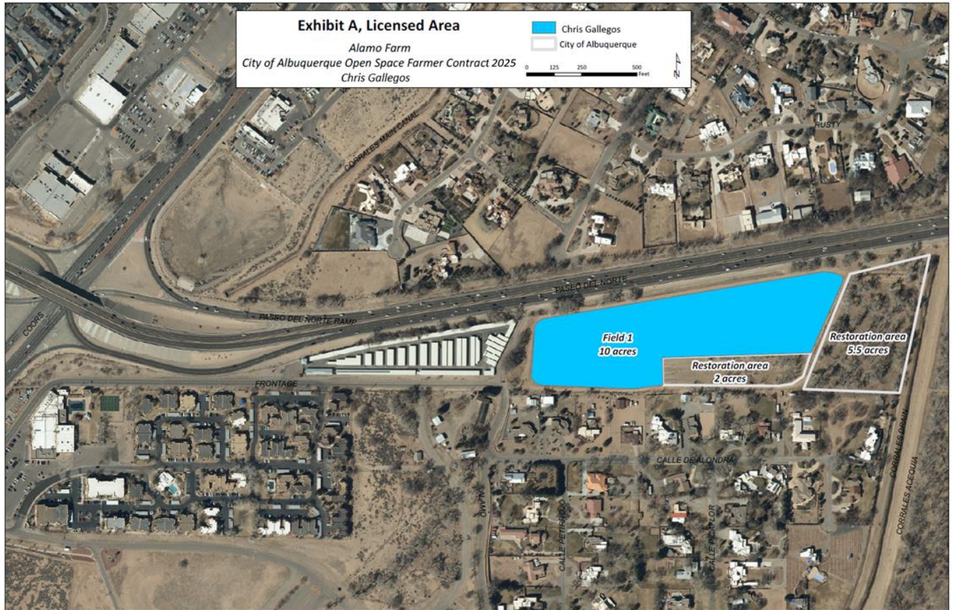
EXHIBIT A LEASED AREA