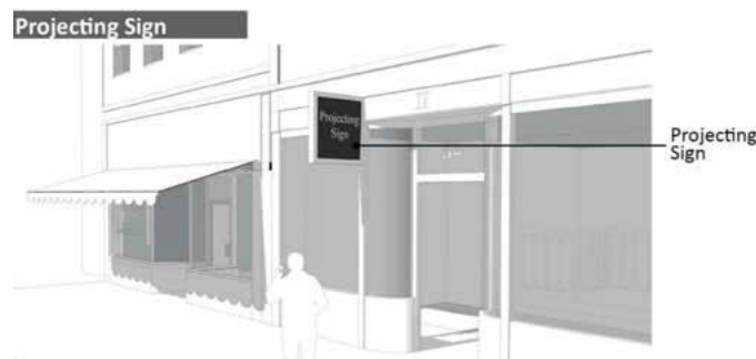
67 68 69 70 71 72 73 74 Exhibit 1. IDO, §7-1, Definition, Projection sign.

75 76 Under the IDO, in any zone district, projection signs can only project (extend) out from 77 a wall facade it is affixed to a total of 30 inches. IDO, § Table 5-12-3. The Appellants' sign 78 plans clearly show that the sign is intended to project out from the church wall a total of 57.5 79 inches [R. 024]. 1